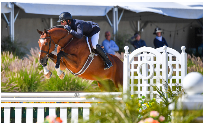
West Coast Spectacular March 12-16, 2025