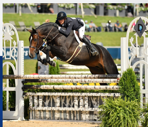
ANDREW RYBACK PHOTOGRAPHY