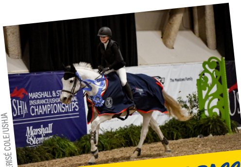
GOLDEN BACKSTAGE PASS