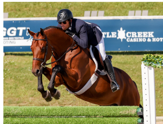
Central Spectacular TBD