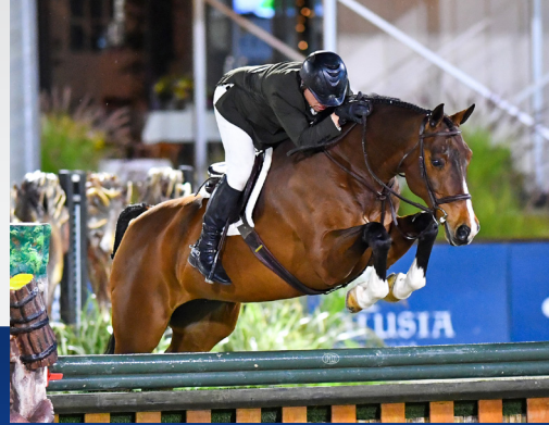
HIGH DESERT SPORT PHOTO