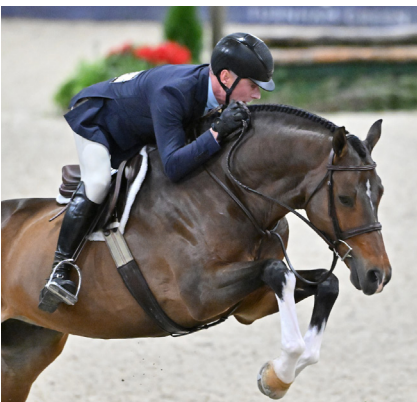
Capital Challenge September 29- October 5, 2025