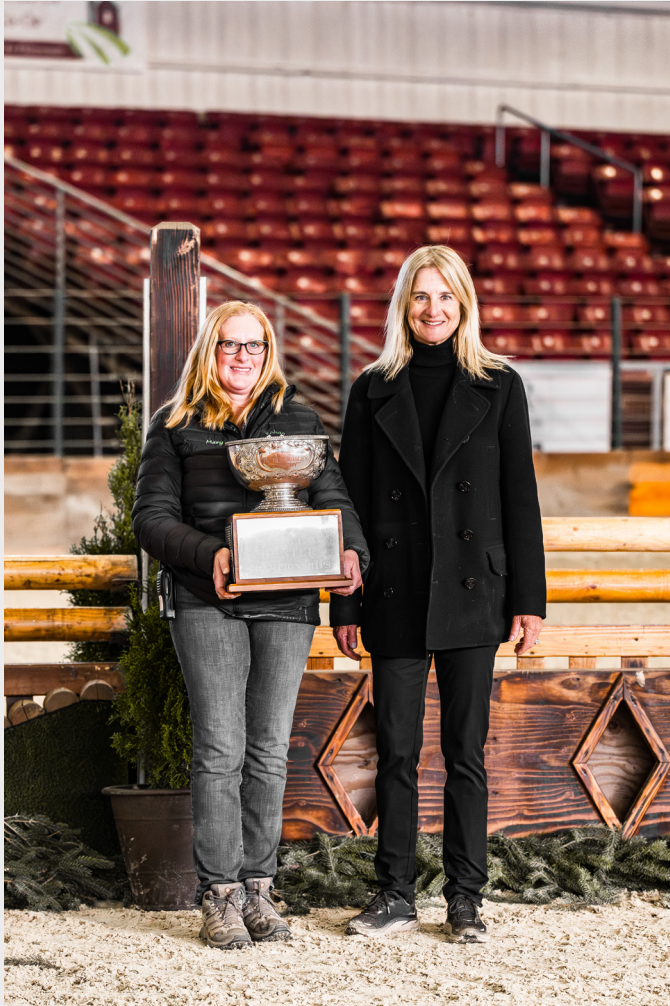
BETTY HEISLEY GREEN HUNTER CHAMPIONSHIP